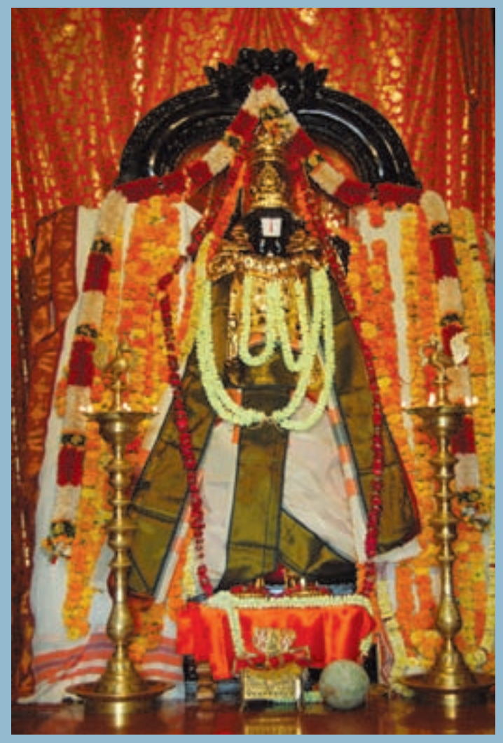
"BHAGWAN TIRUPATI BALAJI" IN THE COMPANY'S TOWNSHIP AT REWA, MADHYA PRADESH